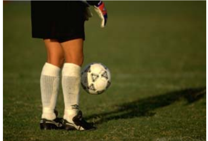
4★STAR ...the ultimate overseeder for sportsfields & hard wearing areas.

Proper seed bed preparation, ample moisture and adequate phosphorus are all necessary in obtaining effective turf grass establishment from seed. Quality's TECH 16-32-6 50% PSCU Starter fertilizer should be mixed uniformly in the upper 4 to 6 inches (10 to 15 cm) of the soil root zone at a rate of 1 lb (0.45 kg) of phosphorus per 1,000 sq ft (100 m 2 ) prior to planting. The ideal seed bed for planting is a moist, granular and firm soil, free of clods, stones and other debris. A firm soil allows more accurate control of the planting depth and better contact between the seed and soil. Broadcast the seed at 6-10 lbs (2.72 kg to 4.54 kg) per 1,000 sq ft (100 m 2 ) then rake lightly ensuring the seed depth is no more than 0.2 to 0.4 inches (0.5 cm to 1 cm). Roll after raking to ensure good seed to soil contact. Water lightly and frequently to keep the newly seeded area moist until the grass is established.