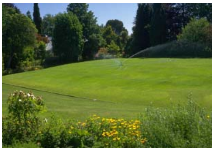
COAST★SUPREME...for West Coast lawns, parks & playgrounds.

Proper seed bed preparation, ample moisture and adequate phosphorus are all necessary in obtaining effective turf grass establishment from seed. Quality's TECH 16-32-6 50% PSCU Starter fertilizer should be mixed uniformly in the upper 4 to 6 inches (10 to 15 cm) of the soil root zone at a rate of 1 lb (0.45 kg) of phosphorus per 1,000 sq ft (100 m 2 ) prior to planting. The ideal seed bed for planting is a moist, granular and firm soil, free of clods, stones and other debris. A firm soil allows more accurate control of the planting depth and better contact between the seed and soil. Broadcast the seed at 6-10 lbs (2.72 kg to 4.54 kg) per 1,000 sq ft (100 m 2 ) then rake lightly ensuring the seed depth is no more than 0.2 to 0.4 inches (0.5 cm to 1 cm). Roll after raking to ensure good seed to soil contact. Water lightly and frequently to keep the newly seeded area moist until the grass is established.