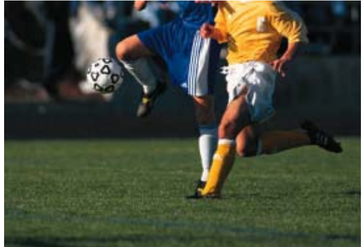
ESTATE★STAR...for superior estate lawns, sportsfields, tees & fairways.

Proper seed bed preparation, ample moisture and adequate phosphorus are all necessary in obtaining effective turf grass establishment from seed. Quality's TECH 16-32-6 50% PSCU Starter fertilizer should be mixed uniformly in the upper 4 to 6 inches (10 to 15 cm) of the soil root zone at a rate of 1 lb (0.45 kg) of phosphorus per 1,000 sq ft (100 m 2 ) prior to planting. The ideal seed bed for planting is a moist, granular and firm soil, free of clods, stones and other debris. A firm soil allows more accurate control of the planting depth and better contact between the seed and soil. Broadcast the seed at 6-10 lbs (2.72 kg to 4.54 kg) per 1,000 sq ft (100 m 2 ) then rake lightly ensuring the seed depth is no more than 0.2 to 0.4 inches (0.5 cm to 1 cm). Roll after raking to ensure good seed to soil contact. Water lightly and frequently to keep the newly seeded area moist until the grass is established.