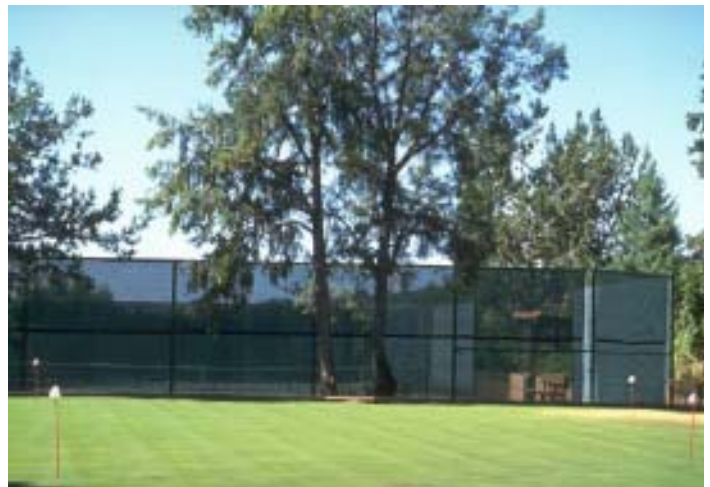
SPORT★SUPREME...a perfect solution for "sand only" sportsfields.

Proper seed bed preparation, ample moisture and adequate phosphorus are all necessary in obtaining effective turf grass establishment from seed. Quality's TECH 16-32-6 50% PSCU Starter fertilizer should be mixed uniformly in the upper 4 to 6 inches (10 to 15 cm) of the soil root zone at a rate of 1 lb (0.45 kg) of phosphorus per 1,000 sq ft (100 m 2 ) prior to planting. The ideal seed bed for planting is a moist, granular and firm soil, free of clods, stones and other debris. A firm soil allows more accurate control of the planting depth and better contact between the seed and soil. Broadcast the seed at 6-10 lbs (2.72 kg to 4.54 kg) per 1,000 sq ft (100 m 2 ) then rake lightly ensuring the seed depth is no more than 0.2 to 0.4 inches (0.5 cm to 1 cm). Roll after raking to ensure good seed to soil contact. Water lightly and frequently to keep the newly seeded area moist until the grass is established.