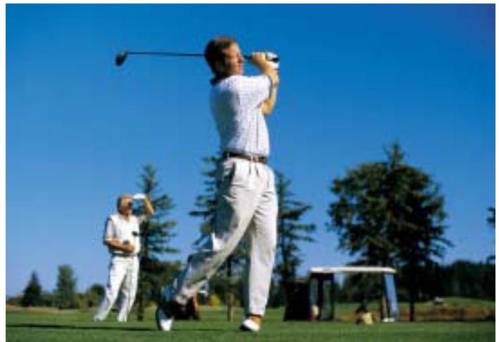
TEE★STAR...excellent for golf tees & hard wearing areas.

Proper seed bed preparation, ample moisture and adequate phosphorus are all necessary in obtaining effective turf grass establishment from seed. Quality's TECH 16-32-6 50% PSCU Starter fertilizer should be mixed uniformly in the upper 4 to 6 inches (10 to 15 cm) of the soil root zone at a rate of 1 lb (0.45 kg) of phosphorus per 1,000 sq ft (100 m 2 ) prior to planting. The ideal seed bed for planting is a moist, granular and firm soil, free of clods, stones and other debris. A firm soil allows more accurate control of the planting depth and better contact between the seed and soil. Broadcast the seed at 6-10 lbs (2.72 kg to 4.54 kg) per 1,000 sq ft (100 m 2 ) then rake lightly ensuring the seed depth is no more than 0.2 to 0.4 inches (0.5 cm to 1 cm). Roll after raking to ensure good seed to soil contact. Water lightly and frequently to keep the newly seeded area moist until the grass is established.