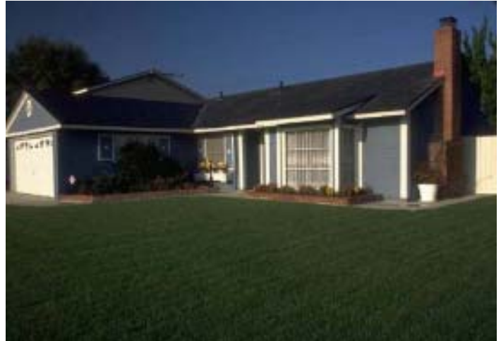
TURF★PRO...a super overseeder for home lawns, sportsfields, parks, etc.

Mowing should begin when the seedlings reach a height that is one-third greater than the